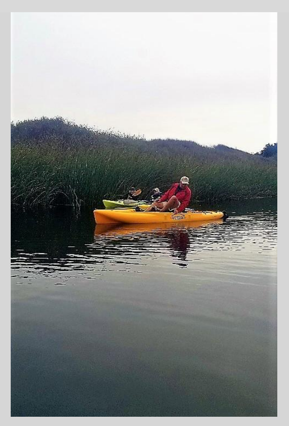
Our invasives team monitors wetland plants and edges of the estuary by boat.

Following the removal of the invasives, we will continue to regularly monitor for regrowth or new seedlings and will treat these areas in various ways to prevent their regrowth and spread. The process includes torching, weed-whacking, digging or hand pulling, or laying a deep mulch layer over cardboard. You may notice our test plots just off the Toyon trail. Many thanks to volunteer leaders Nicole Forte, Jim Nybakken, Mark Escajeda and Cheryl Harris for leading and providing oversight for our volunteers. Formation of volunteer working groups is continuing. Please join us: the CIA (Cape Ivy Adversaries), the Sweepers (Broom and Jubata), or create your own team. New members are always welcome! Contact Cheryl Harris at <a href="mailto:charris@rclc.org">charris@rclc.org</a>