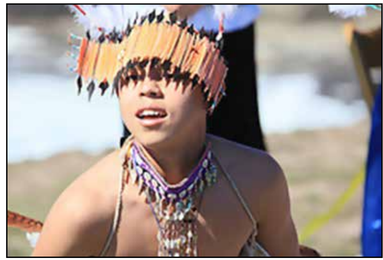
The Manchester Band of the Pomo Tribe performed ceremonial dances.

Team Stornetta is still an active group formed largely to advocate for national monument status and bring the region