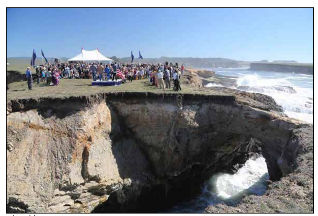
The Celebration

together in support and celebration. Team Stornetta may morph now that its initial objectives have been achieved, but its goal of community unification is so sound that both groups will benefit from all the new partners generated by the effort.